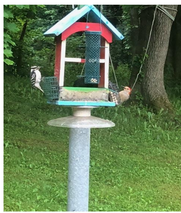
Floyd's woodpeckers "You talking to me"