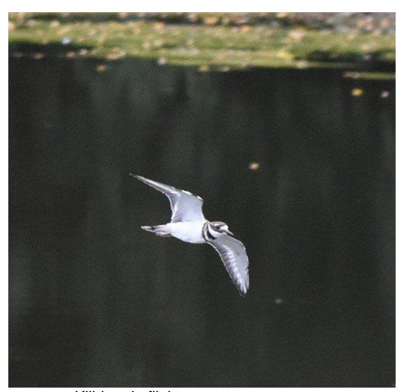
Killdeer in flight