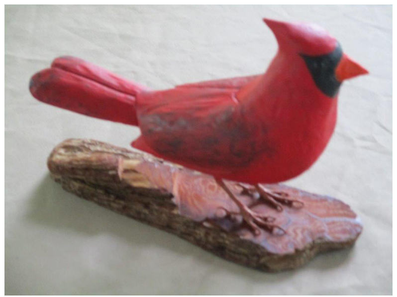
Earl's finished Cardinal