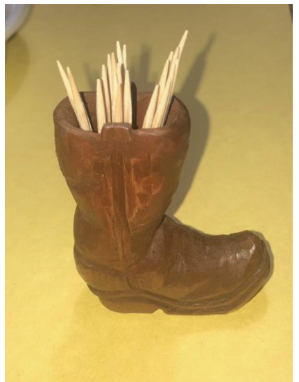
Floyd's toothpick holders